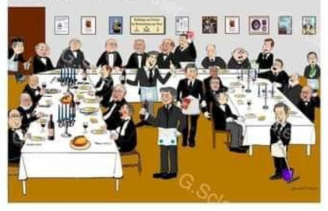
Get them involved