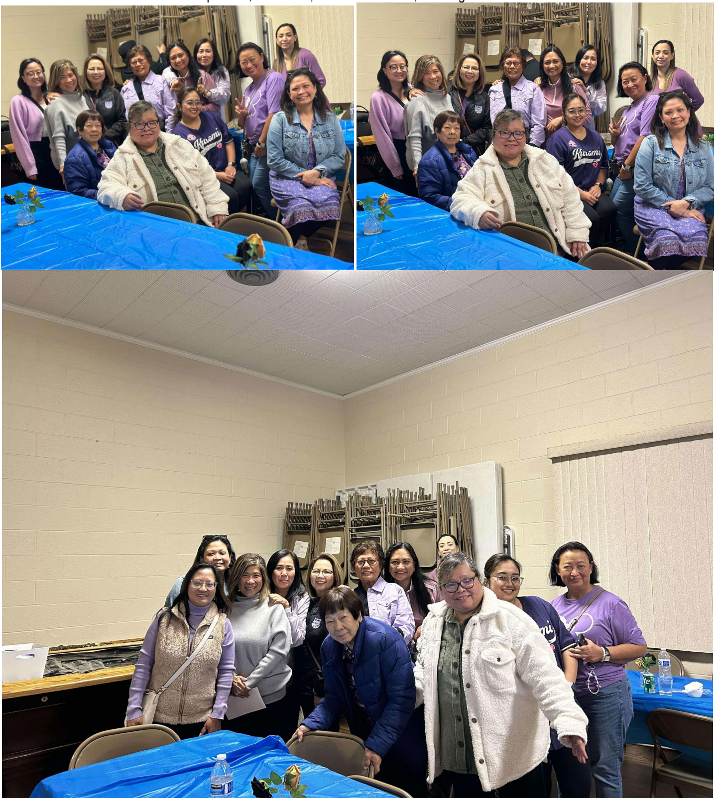
Three fantastic pictures, remember, "without our ladies, this lodge would cease to exist."